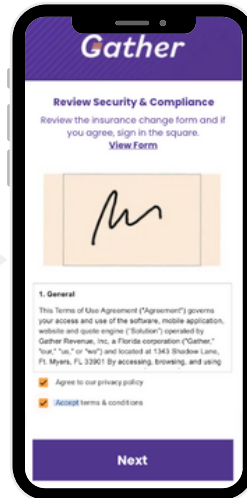
Customer signs the consent form