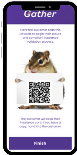
Customer scans the QR code with their phone